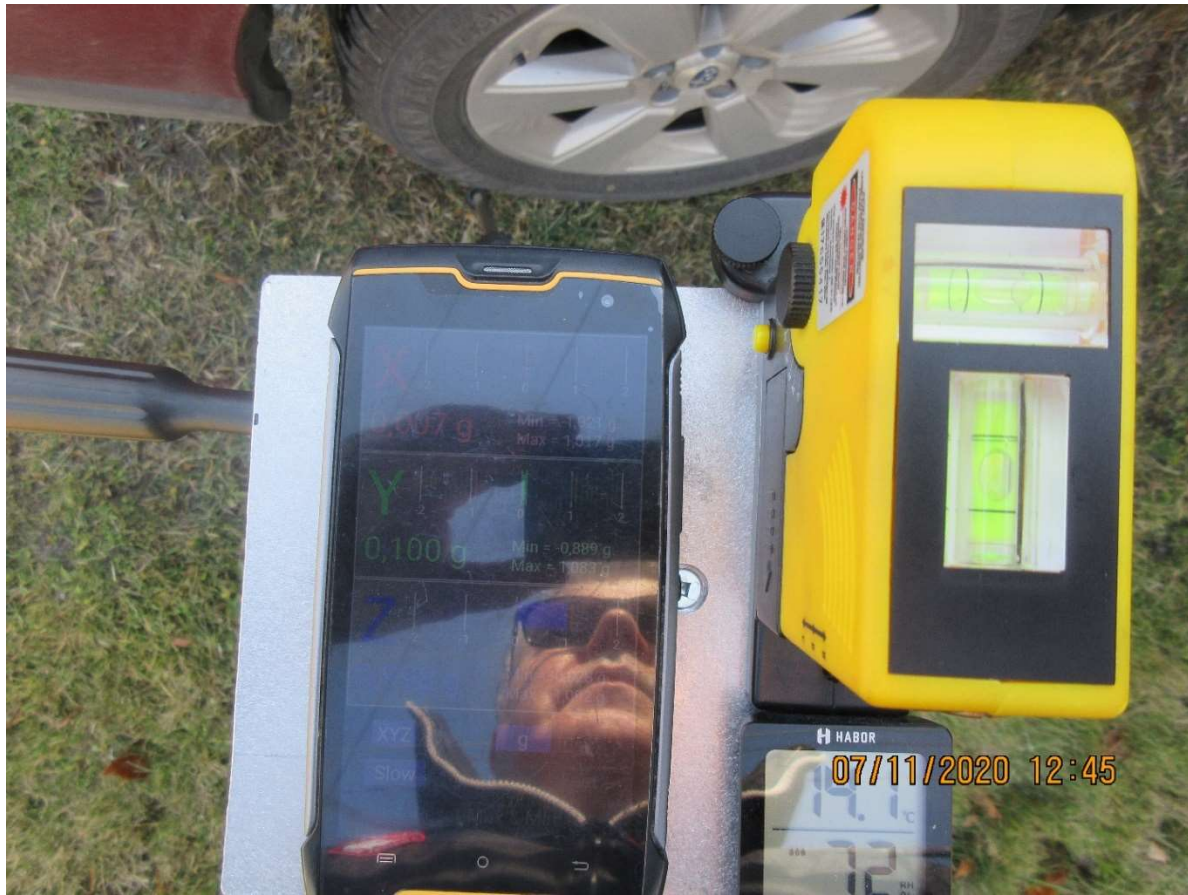
Fig. 5 – accelerometer data: X=0.07g; Y=0.100g; Z=0.998g

In Fig. 5, the X axis is parallel with the width of the phone, the Y axis is in the direction of the nuclear reactors and parallel with the length of the phone and Z axis is in the direction of the ground. The platform is perfectly leveled and there is no tilt to justify the Y-value of 0.100 g. Away from the reactors, in similar conditions, the Y-value is zero.