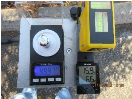
Fig. 2 - measured 49.970 g @ L1

The discrepancy between the measured weight and the calibrated weight is up to 10 times larger than the scale error. Therefore, the average 0.05% decrease of the test body weight is considered measurable and significant.