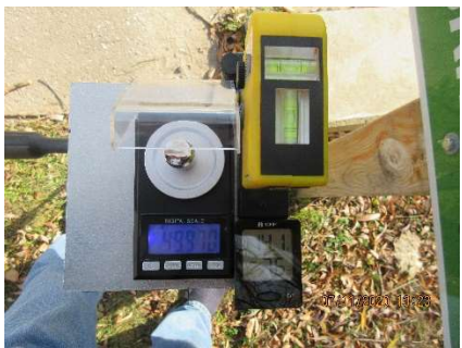
Fig. 4 - measured 49.975 g @ L3

Provided the above experiment is reproduced and confirmed by other researchers, the loss of weight of a test body exposed to a flux of antineutrinos generated by nuclear reactors needs an explanation.