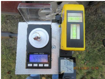
Fig. 3 - measured 49.984 g @ L2